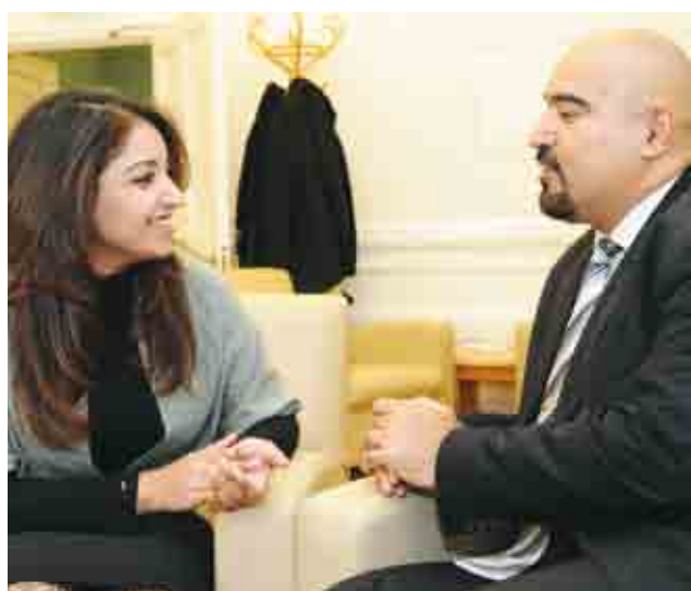
All overseas business is managed through our dedicated International Office